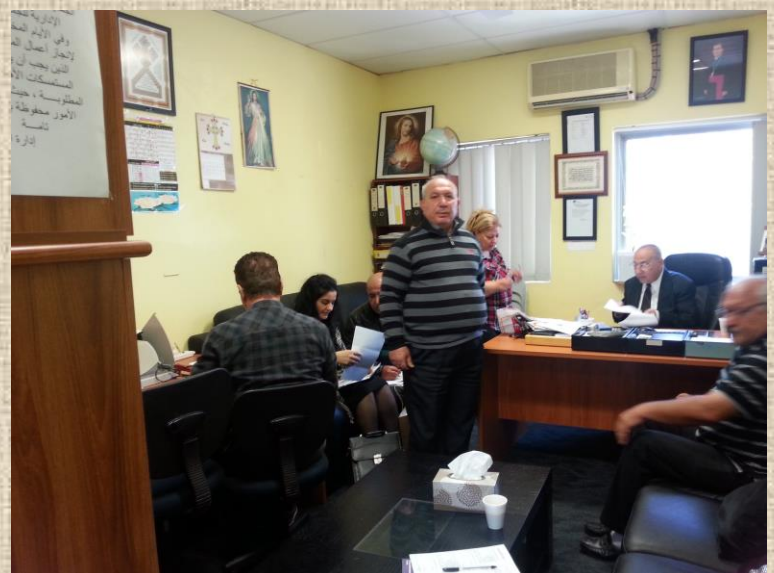
CAS Members Providing Support to Refugees and Migrants